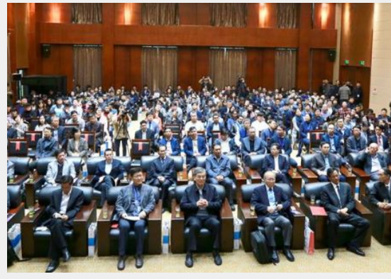
<ICCT2018 opening ceremony>