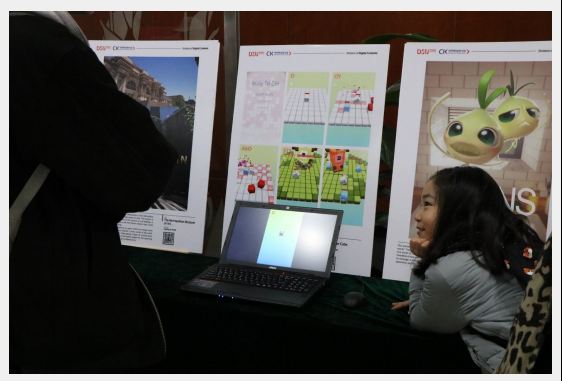
<new(er) generation shows her interest in ISCC>

We also had visited Jinggong Holding Group and a factory that manufactures one of the local specialties, Yellow Wine(Yellow Rice Wine, also called "Shaoxing Wine"). It was quite a special thing we could meet in Shaoxing city during ICCT2018.