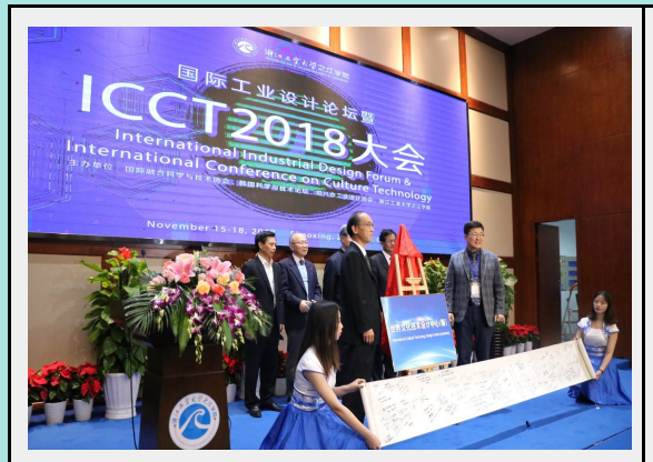
<ICCT2018 opening ceremony>

ICCT2018 was held with Shaoxing City's active support and with Zhijiang College of Zhejiang University of Technology, Shaoxing University Yuanpei College, Zhejiang Yuexiu University of Foreign Languages, and Shaoxing Industrial Design Research Institute in cooperation, and more than 220 academic societies and industry workers in over 10 countries participated.