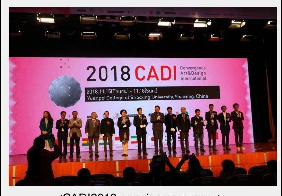
<CADI2018 opening ceremony>

ISCC 2018 was an event held together with ICCT 2018 (International Conference on Culture Technology) International Academic Conference and CADI 2018 (Convergence Art & Design International) International Convergence Art & Design Exhibition. ISCC 2018, which was an experimental stage, achieved a great success, and the future ISCC is more promising.